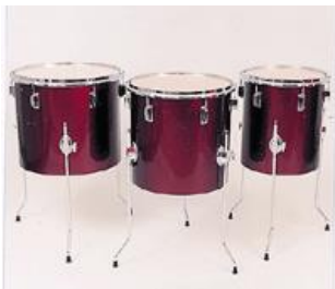
Tom Tom Drums