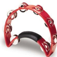
Half Moon Tambourine