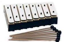
Chime Bars (individual)