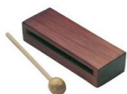
Wooden Block and Beater